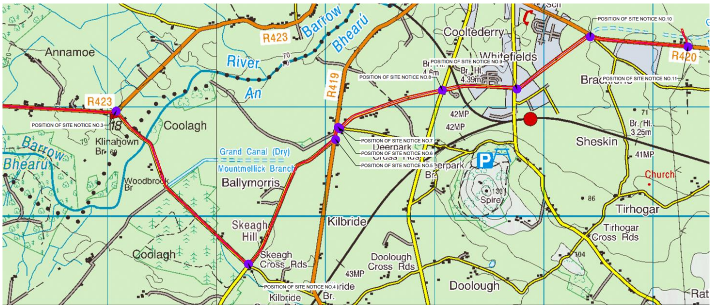
Figure 2: Site Location Map #1 of Subject Site with proposed Site Notice Locations (SN#3 - #11)