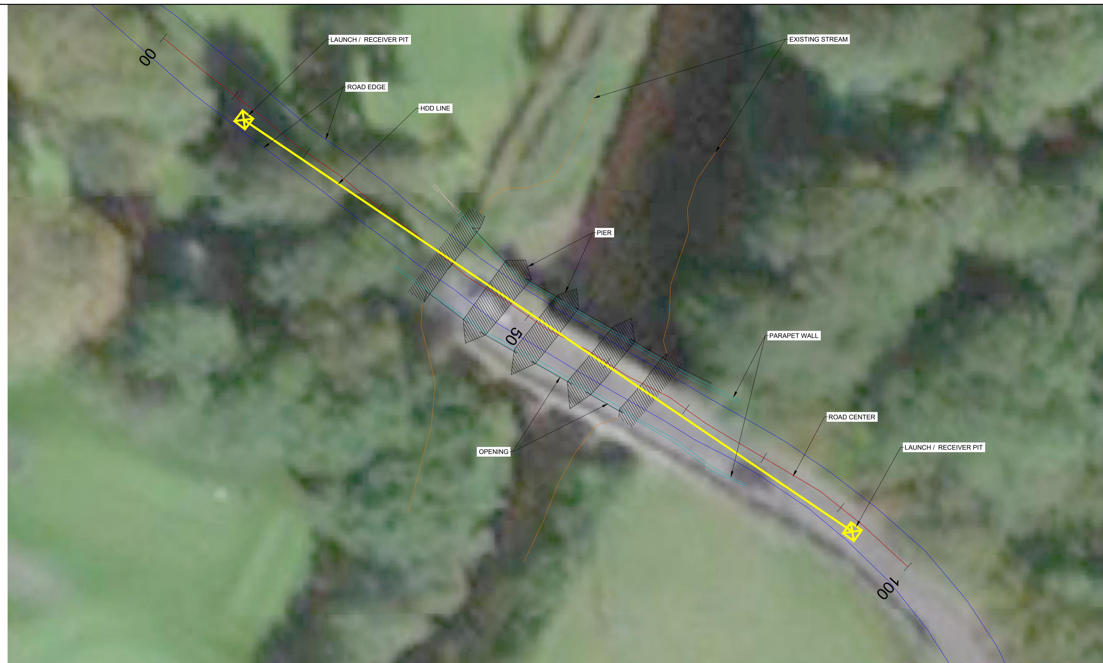
KLINAHOWEN BRIDGE HDD PLAN (WATERCOURSE CROSSING NO.11) SCALE 1:250