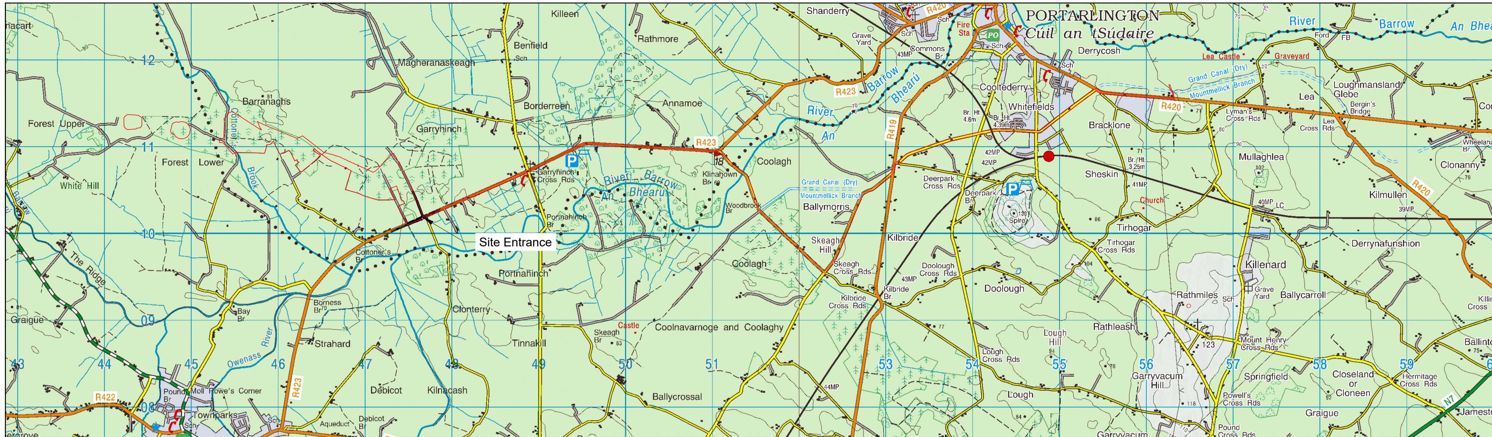
Site Entrance Location Scale 1:25,000